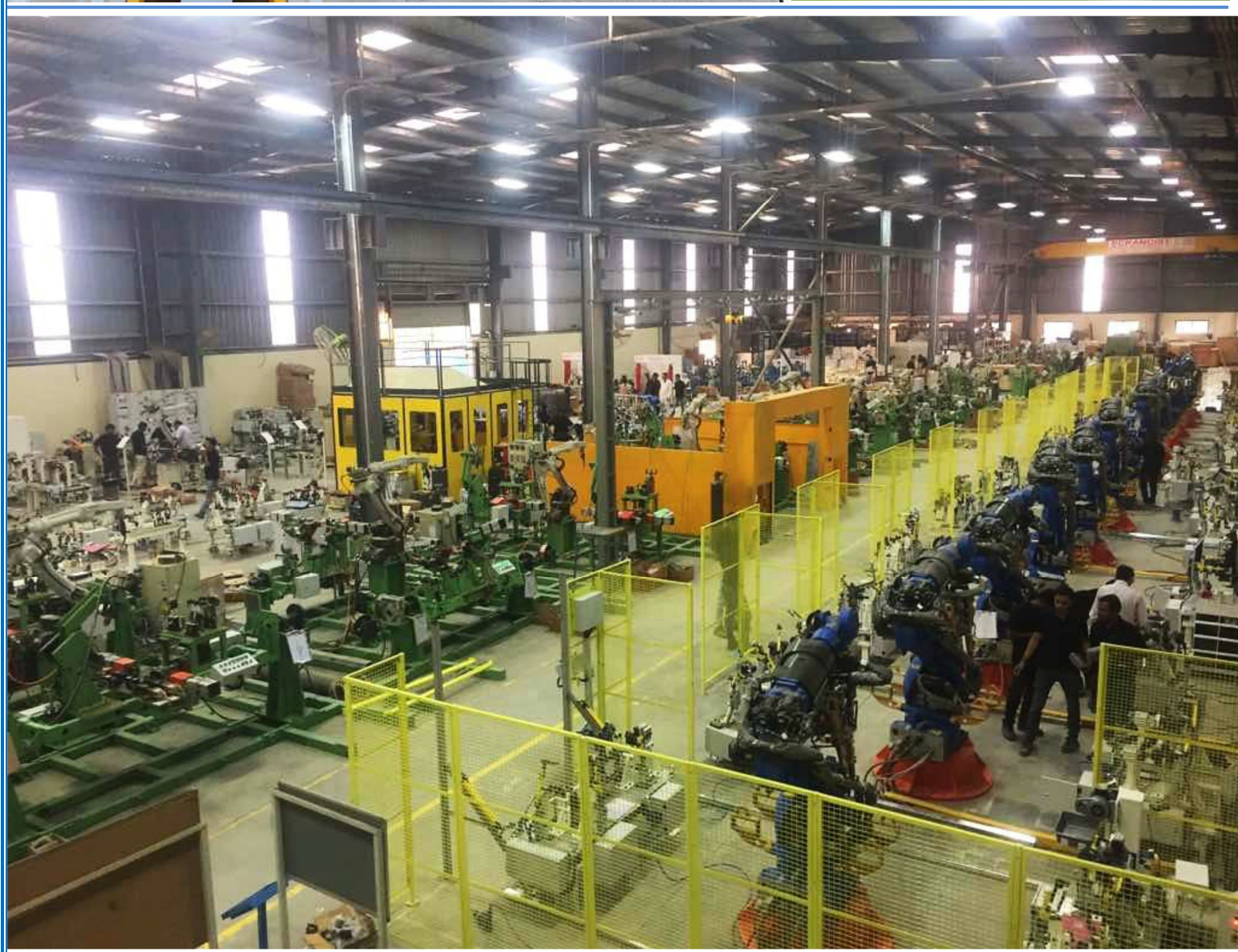
Thirteenth Annual Report 2021-22